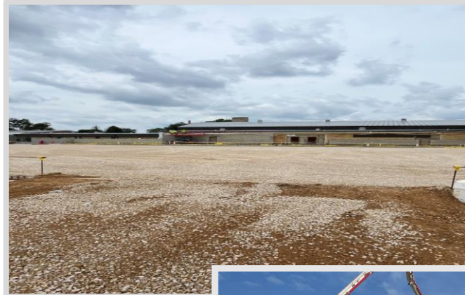
To the Left:

In the coming weeks, the Masons are going to be extremely busy laying block in the new locker rooms and moving to the gym to lay up the block gym walls inside of the pre-engineered metal building. Speaking of the pre-engineered metal building, that will also be arriving onsite next week! This week we will be completing the slab on grade pour at the classroom addition.