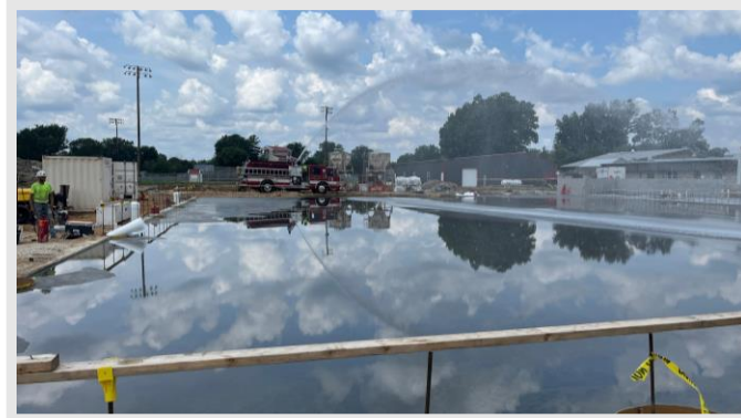
Boscobel Fire Department helping Findorff's Finishers Crew spray water onto the slab to water cure the slab!

Members of the School Board and Findorff Team touring the site during the big gymnasium slab on grade pour!