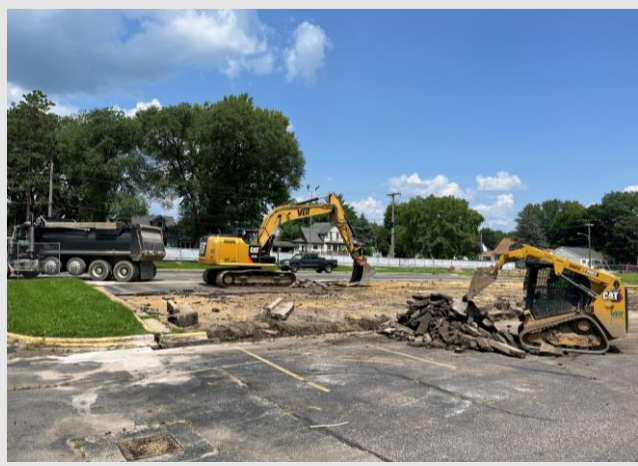
Veit Stripping the North Parking Lot with Frey Trucking