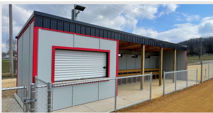
New Dugouts will have press boxes for Media Coverage, and Storage for softball and baseball equipment.