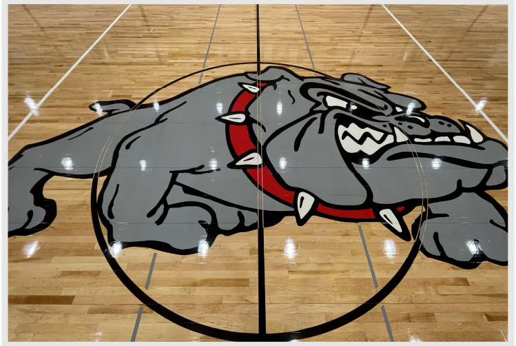
Here is a sneak peak of our new gym floor! Be sure to catch a tip-off or opening serve to see what other surprises the gym has in store.

Now back onsite, Veit USA has returned to remove the spoil piles and bring the site to finished grades for paving and sidewalks. Olson Toon Landscaping has been finishing newly seeded areas with erosion mat.