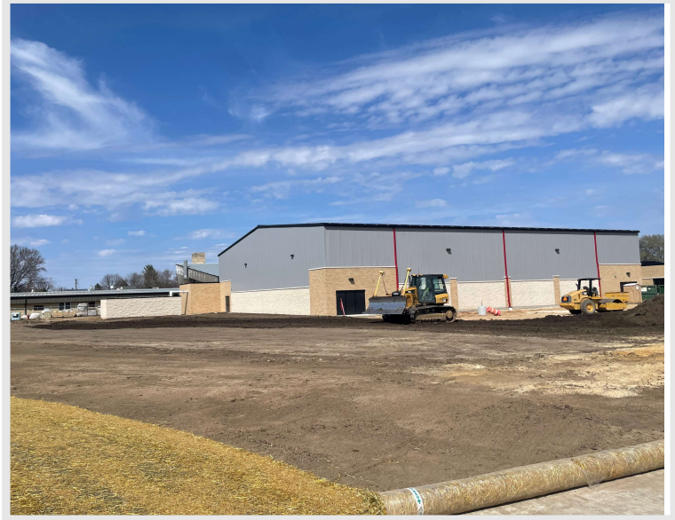
Veit USA is grading out West side of the gym and prepping for the new playground area that is set to come next July.