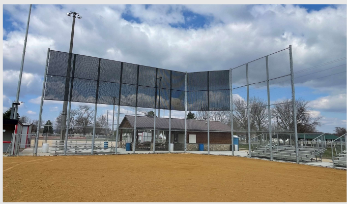
A new 32' chain link backstop with Black Vinyl Slat sunshade will protect spectators behind home plate.

We are fast approaching the grand opening event for the Kronshage Park Fields! We have installed a custom wind screen and red fence cap that make this field feel uniquely home to our Boscobel Bulldogs! The landscapers have cleaned up the batting cage area and behind dugouts, and the new Musco lighting has been energized. We are looking forward to the arrival of our new scoreboards for both fields as well as setting up the batting cage area. Be sure to mark your calendar for Thursday May 8 th !