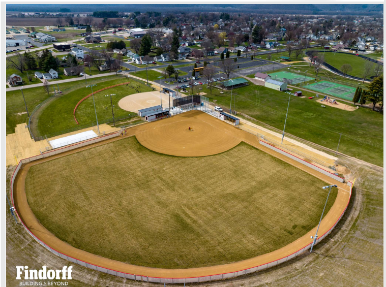
Drone Photo of the overall baseball field with sod outfield, new lighting, new dugouts, custom wind screen and fence cap.