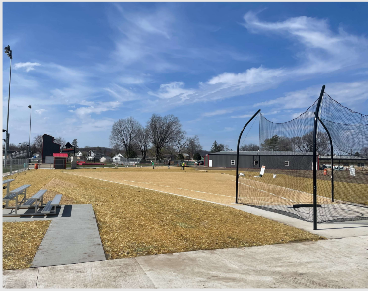
The Shotput Pit is ready just in time for Track and Field Season.