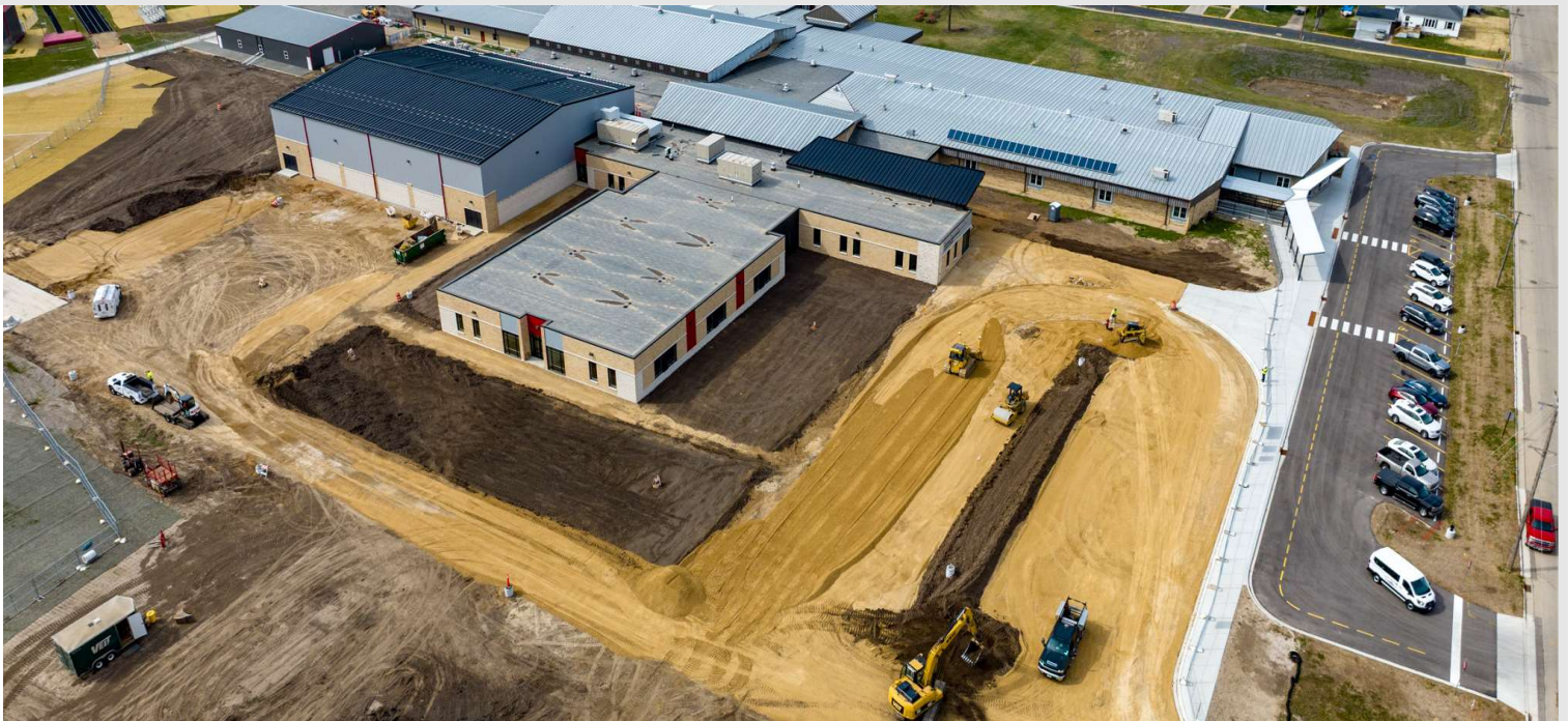
The warmer weather has certainly allowed for Veit USA to get our site into shape for the site concrete, asphalt, and Landscaping yet to come. They are focusing heavily on grading the parent drop off loop and will resume work on the bioretention basin soon.